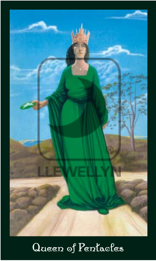
Queen of Pentacles