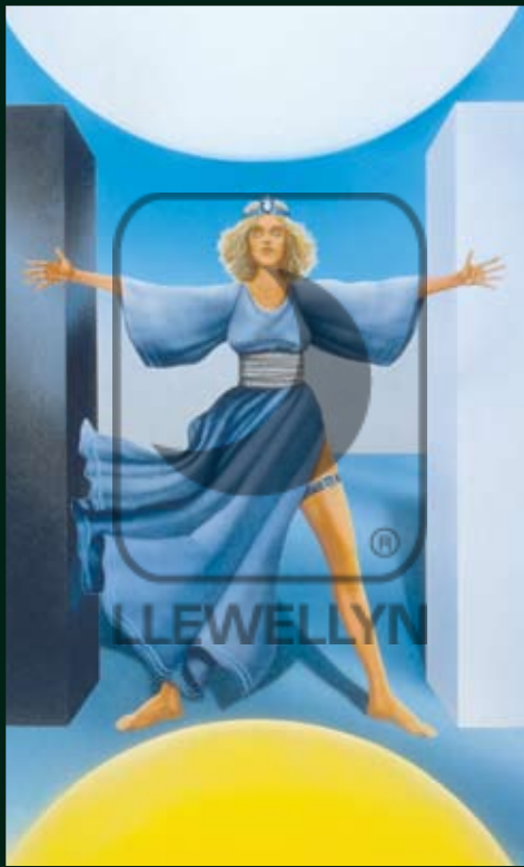
II The High Priestess