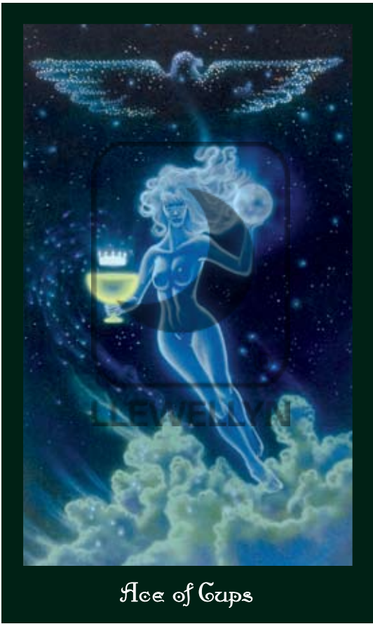
Ace of Cups