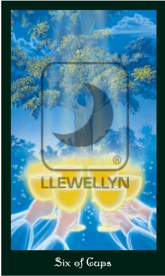
Six of Cups