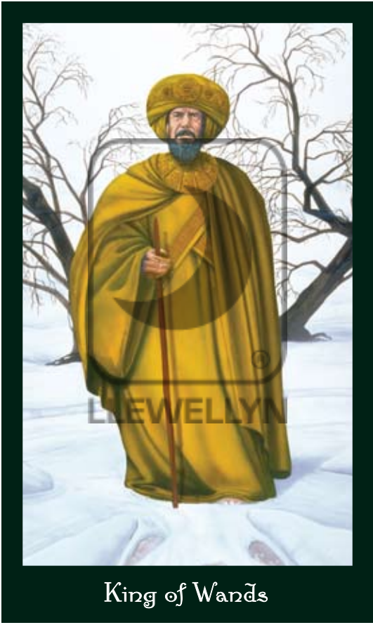
King of Wands