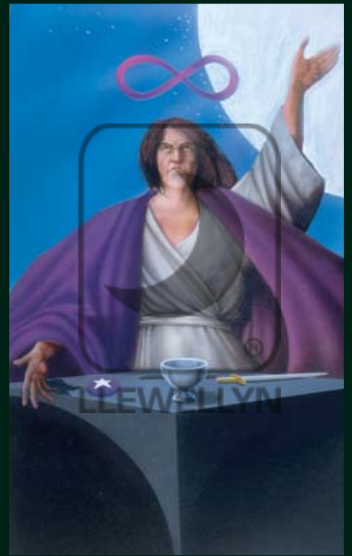
I The Magician