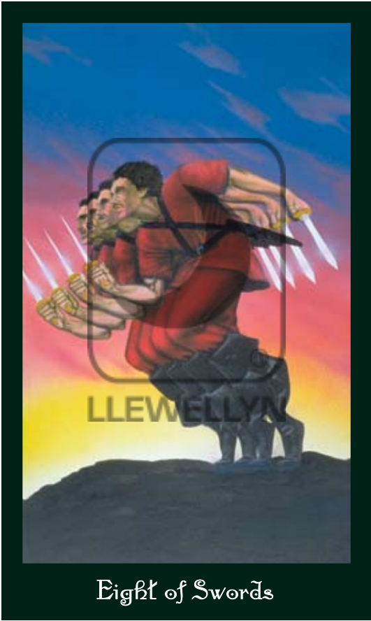
Eight of Swords