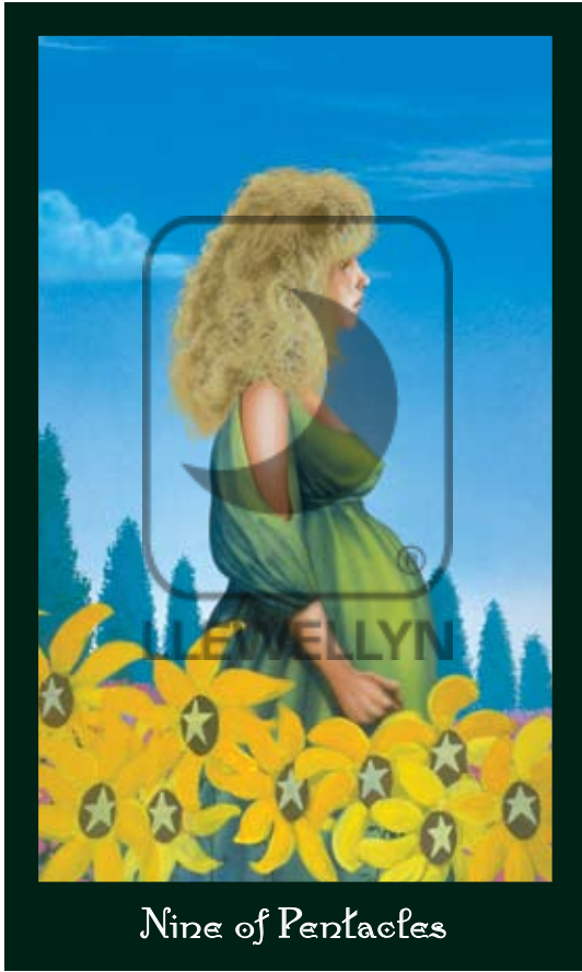
Nine of Pentacles